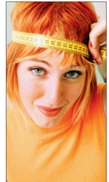
DOWNSIZE THIS: The average size of human brain has shrunk by 10%

But other anthropologists note that brain shrinkage is not very surprising since the stronger and larger we are, the more gray matter we need to control this larger mass. The Neanderthal, a cousin of the modern human who disappeared about