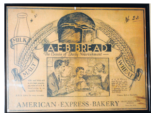
An AEB bread advertisement from the '30s

IT'S POPULAR COUSIN MAY SIT IN BANDRA, BUT THE ORIGINAL AMERICAN EXPRESS BAKERY AT BYCULLA'S CLARE ROAD IS PACKED WITH NOSTALGIA, HONEY-GLAZED PASTRIES AND MOST GOODIES UNDER 100 BUCKS