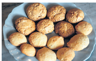
Macaroons and wine biscuits are its signature products

If you manage to distract yourself from the culinary temptations, the walls sport frames of newspa-