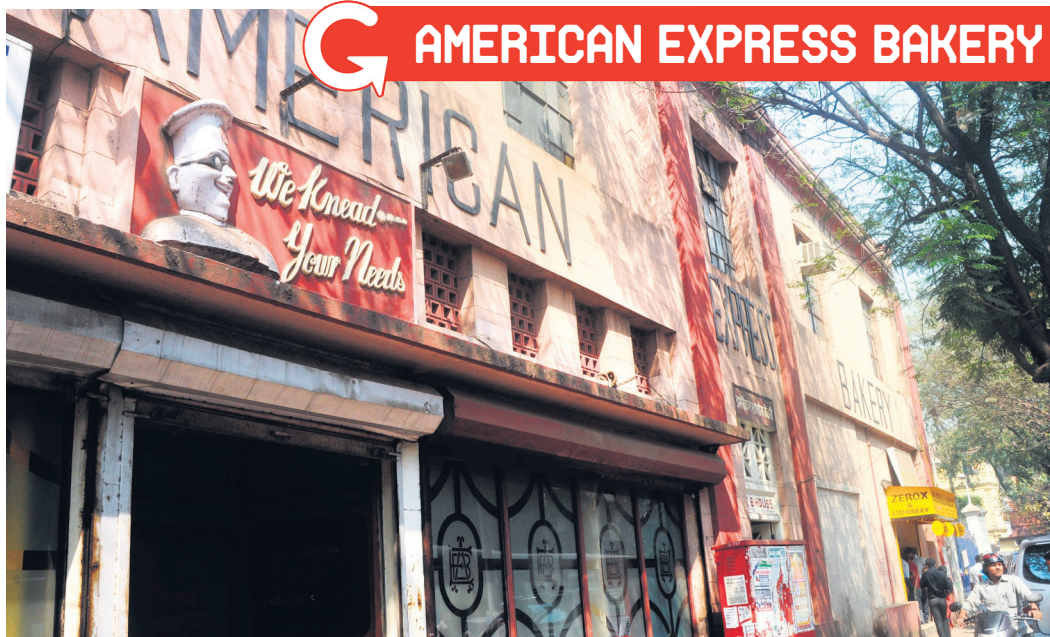
The familiar outer facade of American Express Bakery.