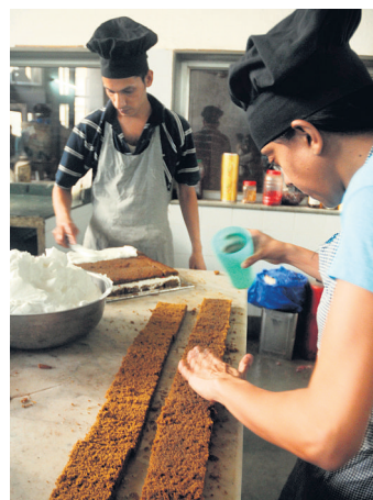
Moistening a pastry before it's set in the oven

Back in the early 1990s, AEB were the first to introduce the Hungarian Coffee Cake and Lemon Pie. "This was much before coffee shops hit on the idea," adds