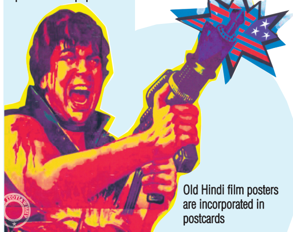
Old Hindi film posters are incorporated in postcards