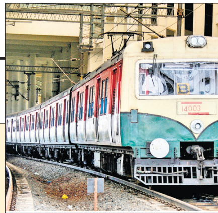
Commuters need to depend on autos as busy areas lack stations